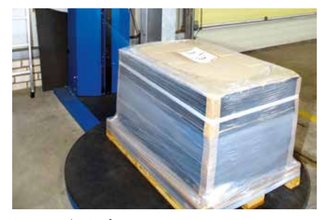
Secure packaging for transport