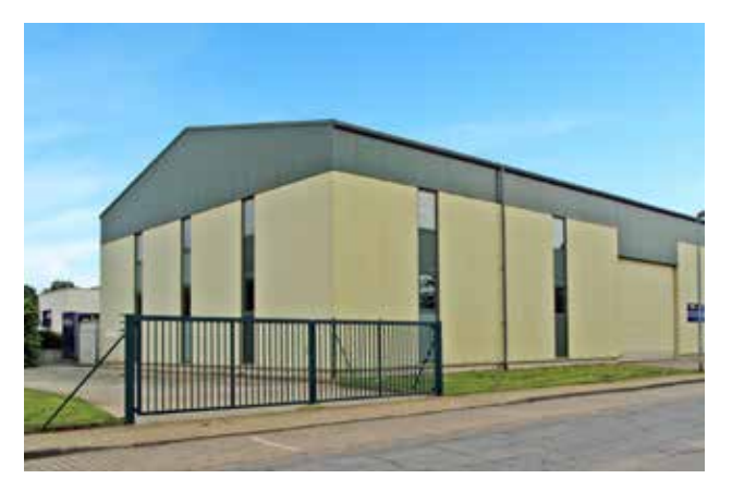
Building view of the Battery Care Station