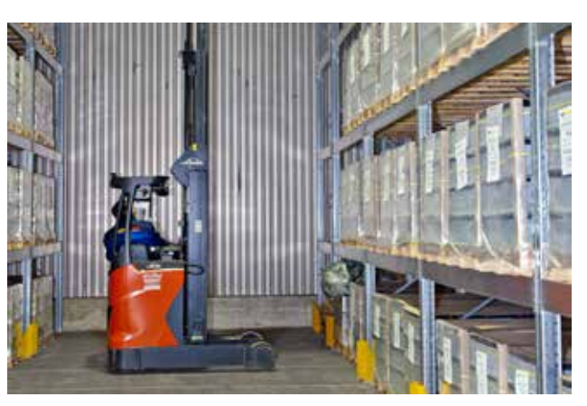
Batteries ready to deliver