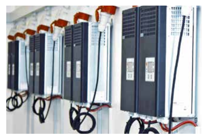
Latest charging technology